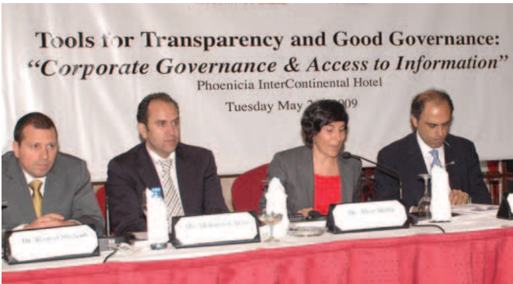
Event in Beirut to launch the corporate governance guidebook for family-owned enterprises and listed companies developed by the Lebanese Transparency Association, May 2009.

Nearly 80 percent of the company’s case load can now be resolved by employees with few