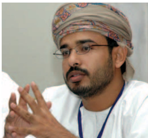
Participant from a workshop on creating a corporate governance task force in Oman facilitated by CIPE, February 2008.

The chairman is in charge of running meetings in an efficient manner. Meeting procedures and agenda-setting should be developed as board guidelines. The following example illustrates a typical structure for board meetings: