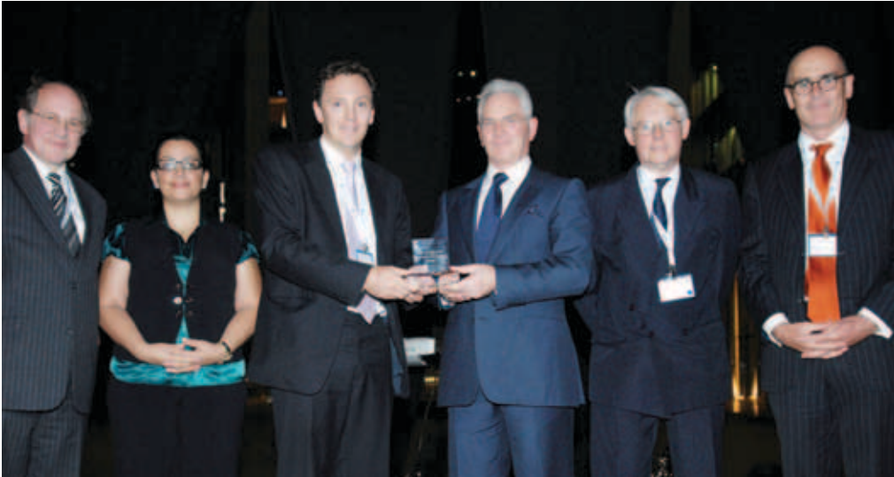
The Abu Dhabi Commercial Bank wins a “2009 Bank Corporate Governance Award” from the Hawkamah Institute of Corporate Governance in November 2009.

well as brokerage and asset management services through a network of some 49 branches in the UAE and India. It also holds 25 percent of Malaysian banking group RHB Capital.