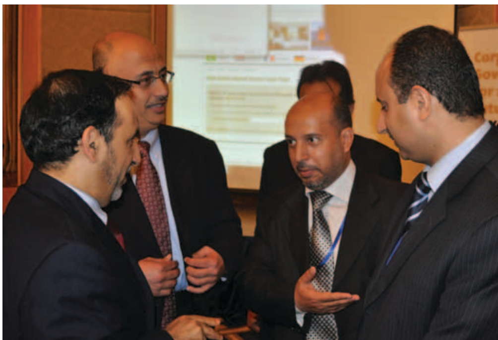
Launch of the Yemen Guidelines for Corporate Governance organized by the Yemeni Businessmen Club and CIPE, March 2010.

constructive debates tends to be difficult if the board exceeds 12 directors, and smaller boards tend to be more effective and productive. The key is to find the most effective balance while still keeping in mind legal requirements. 35 In most developed countries with dispersed ownership, boards average seven to 11 members.